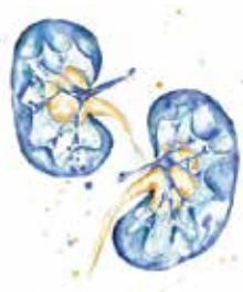
Urine my thoughts