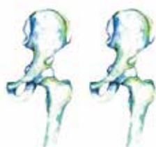
Hip Hip Hooray