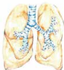
We be-lung together